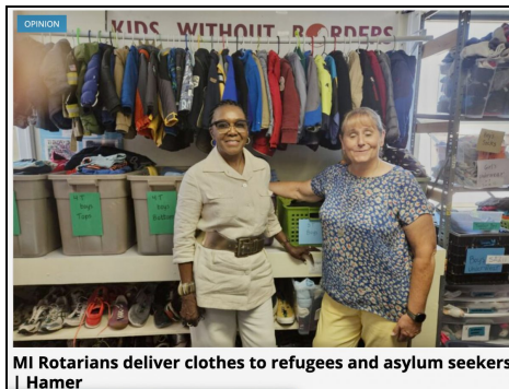
MI Rotarians deliver clothes to refugees and asylum seekers | Hamer